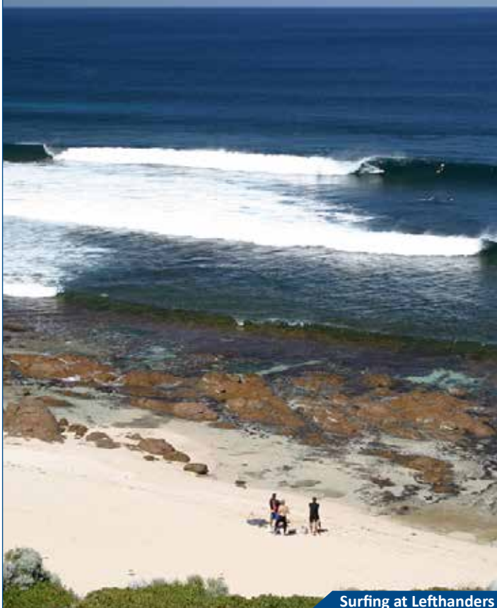
Surfing at Lefthanders