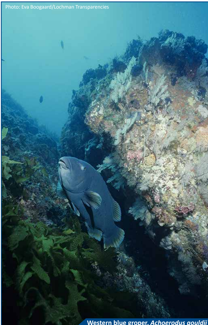
Western blue groper, Achoerodus gouldii